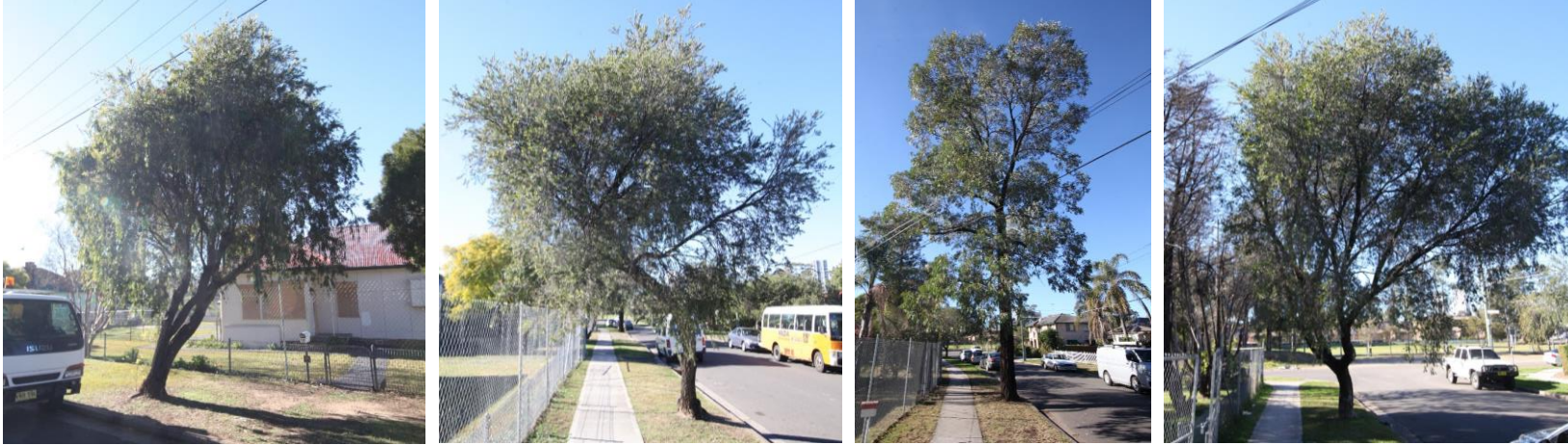
Image 1 above left shows tree 1 on the council nature strip. Image 2 above centre shows tree 2 on the council nature strip. Image 3 above right centre shows tree 3 on the council nature strip. Image 4 above right shows tree 4 on the council Nature strip. Image 5 below left shows trees 5-7. Image 6 below centre shows trees 8-11. Image 7 below right shows trees 12-14.