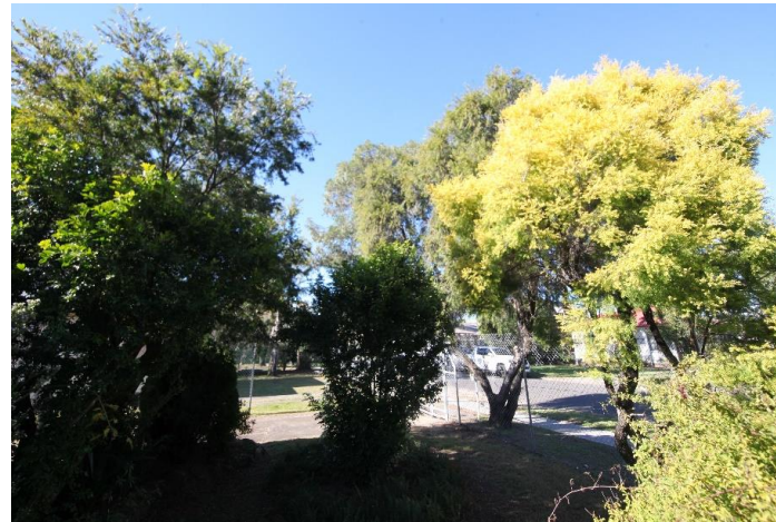
Image 8 above left shows trees 15-21. Image 9 above centre shows tree 21. Image 10 above right shows trees 22-24. Image 11 below left shows tree 25. Image 12 below centre shows tree 26. Image 13 below right shows trees 27 & 28.